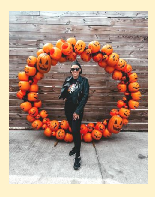
Have you considered temporary photo ops in your community?