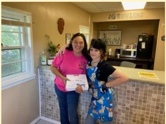
Welcome J Howlers Pet Grooming to downtown Taylorsville! 222 West Main Street